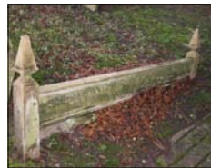
Gravemarker, Golden Cross, Sussex

This public lecture, on an historical subject is given after the Annual Business Meeting, which is normally held in the Spring.