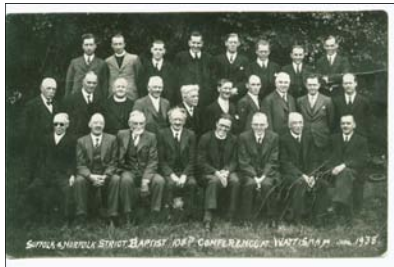
Suffolk and Norfolk Strict Baptist 108th Conference, Wattisham, June 1938